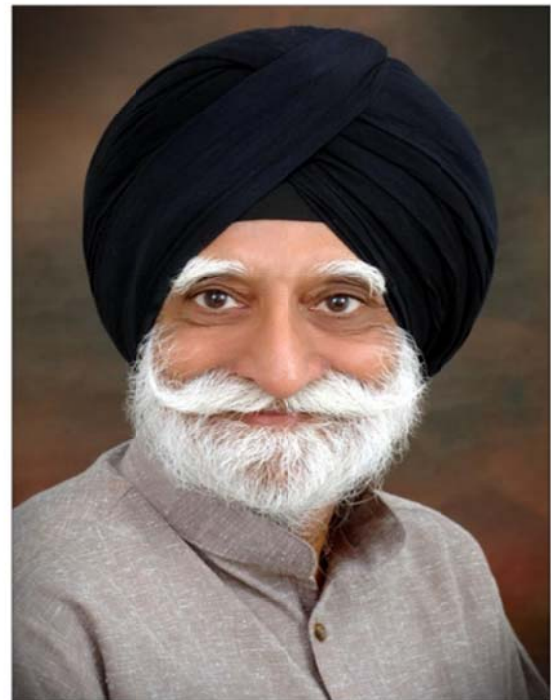
Sunder Studios No. 41-D

During Guru Nanak's times, there were sects of chiefly Mohammedans, Hindus and Nath-Yogis prevalent around him though he had had interaction with many other sects during his long tours in India and abroad (these tours are known as Udasis). But